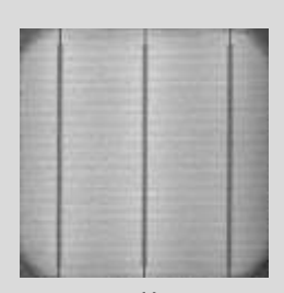
with SMB SOLAR-MULTIBOARD

Business Unit Manager Solar Energy TÜV Rheinland